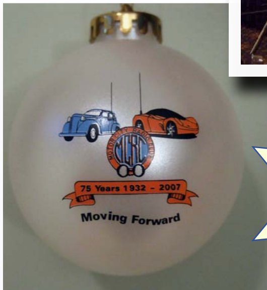
75th Anniversary Ornament